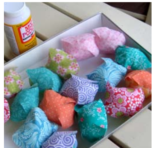
Step 7, pinned and ready to glue